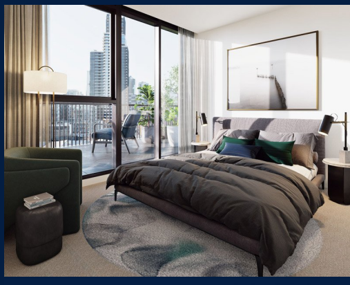
Roden: 3 - Bedroom